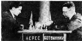
16. 1948: the match tournament